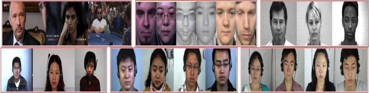
Fig. 2: Snapshots of six micro-expression datasets. From left to right and from top to bottom, these are as follows: MEVIEW [28], SAMM [29], SMIC [30], CASME [31], CASME II [32], and CAS(ME)2 [33].